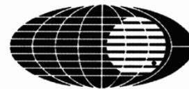
DIAGRAM NO. 1 Date February 1999